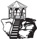
Quinipet Camp & Retreat Center Shelter Island Heights, NY