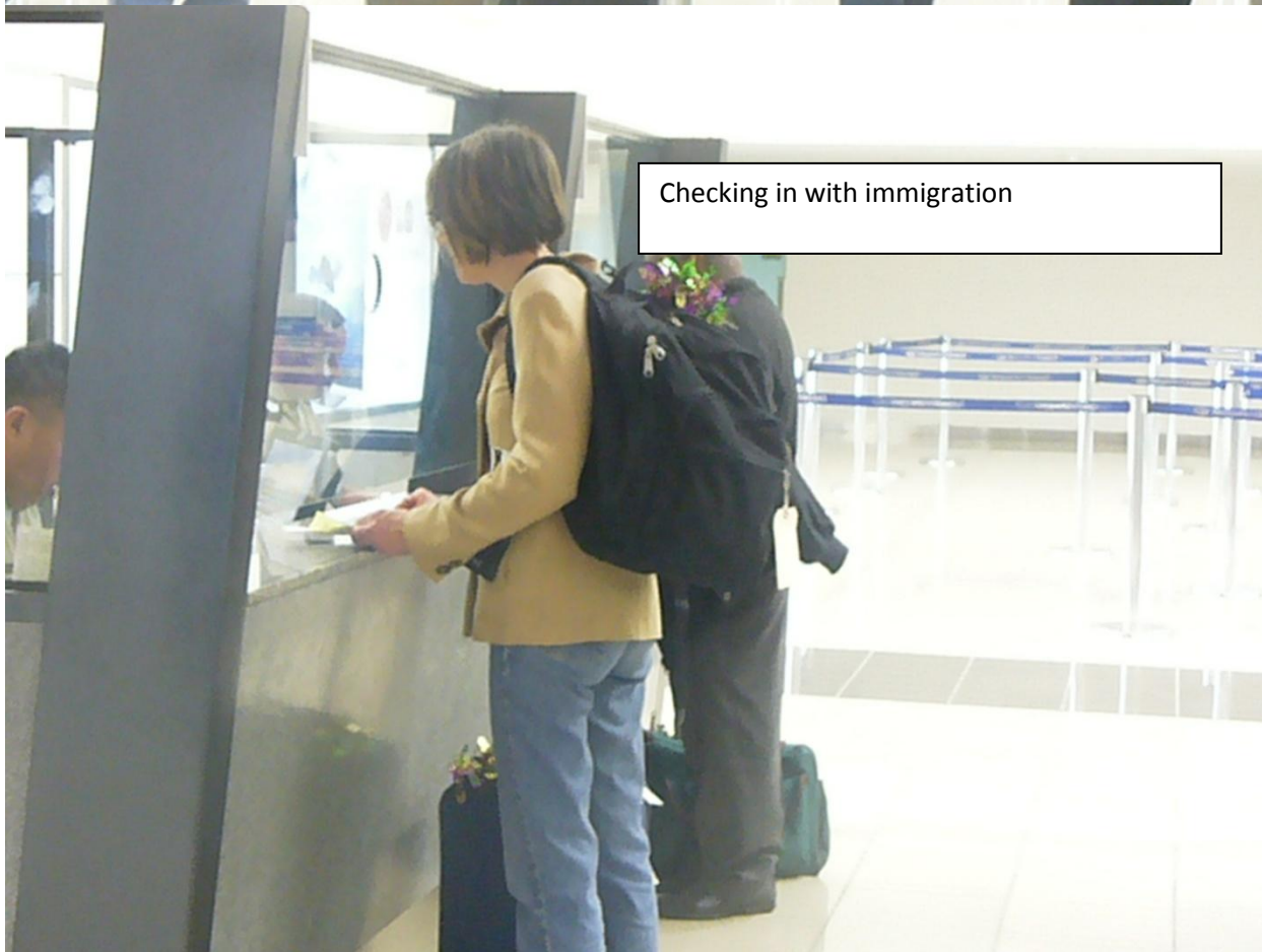
Checking in with immigration