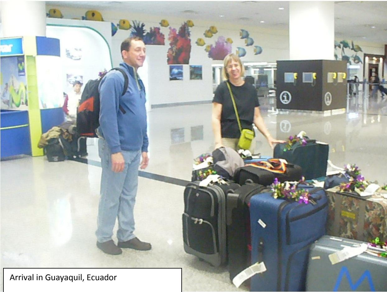
Arrival in Guayaquil, Ecuador

Here's some photos of our journey thus far.