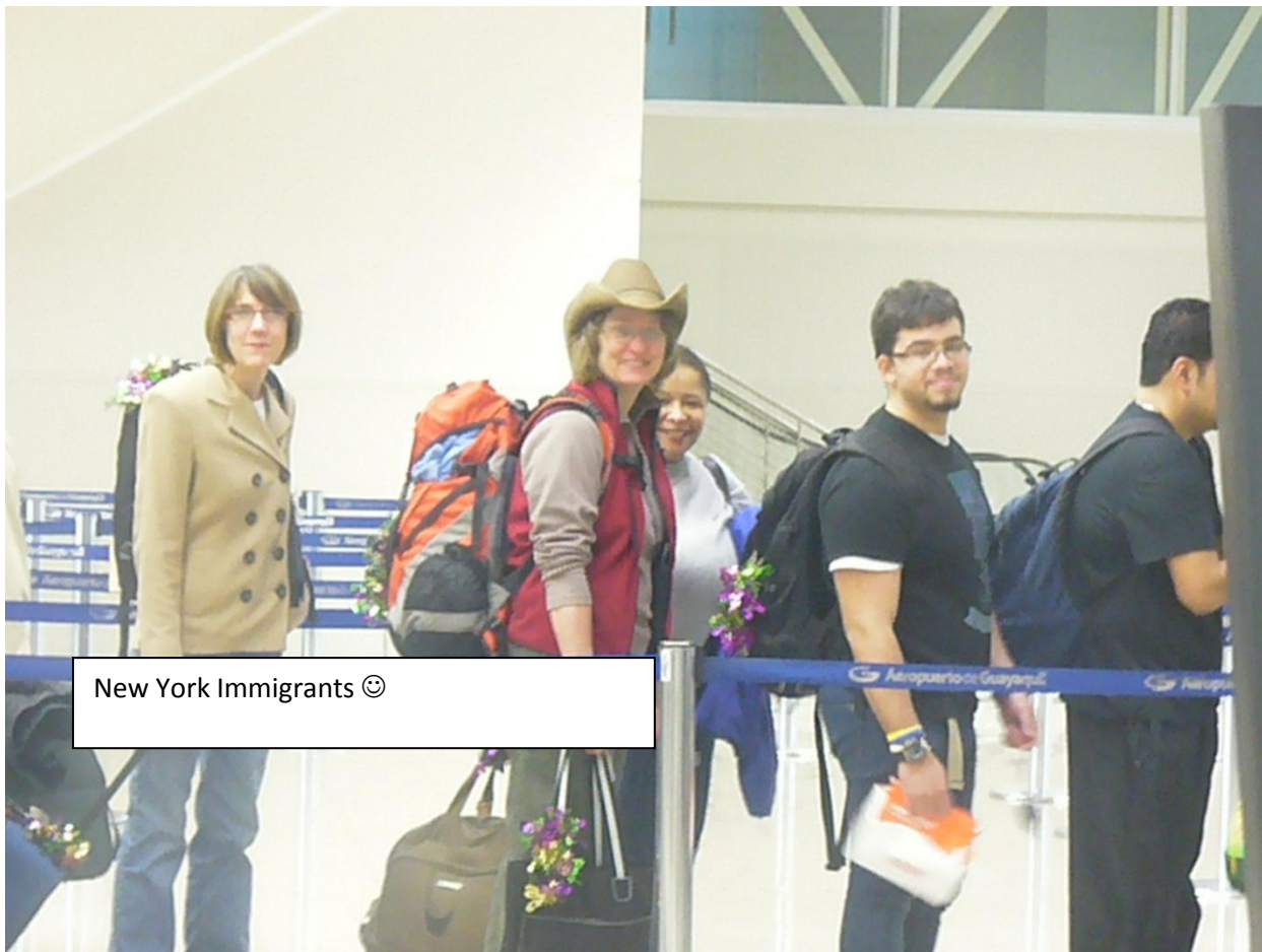
New York Immigrants 😊